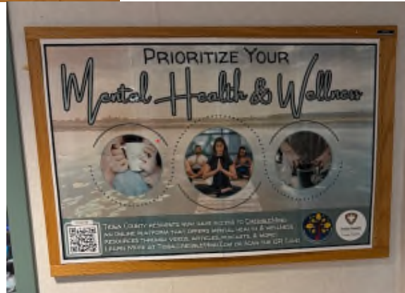
Bulletin Boards: Health & Human Services Building-May 2025