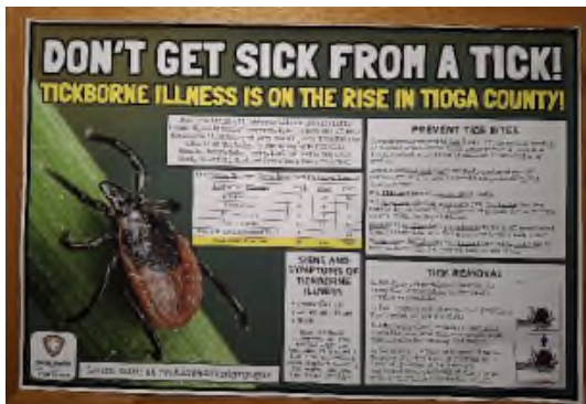
Bulletin Board: 56 Main Street-May 2025