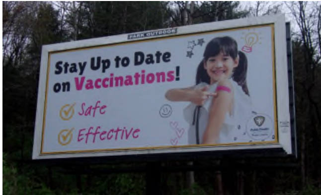
Billboard: Immunization Promotion